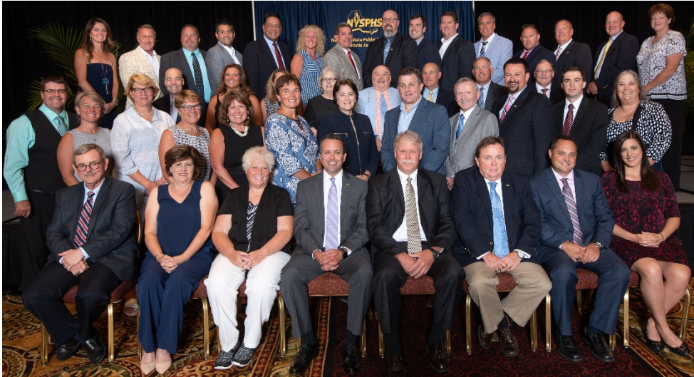
2018-2019 NYSPHSAA Central Committee, Staff and Officers